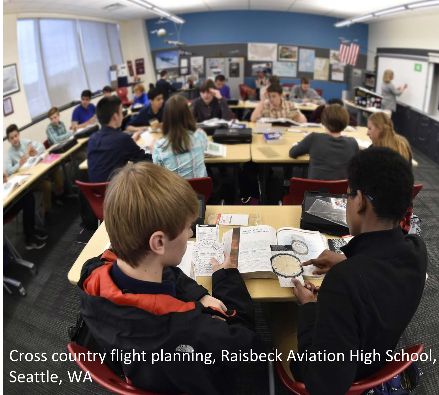
Cross country flight planning, Raisbeck Aviation High School, Seattle, WA