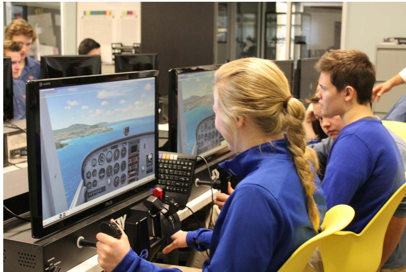
Students in flight training, West Michigan Aviation Academy, Grand Rapids, Michigan